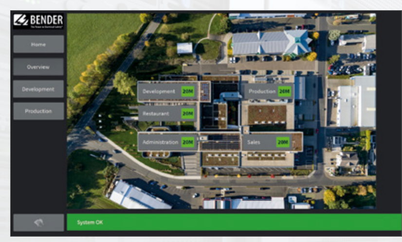
Individual visualisations tailored to the system can be generated

Thanks to the variety of display options, the devices of the COMTRAXX<sup>®</sup> CP9...-I series can be optimally integrated into any environment. The system status is constantly monitored, critical operating conditions are pointed out at an early stage and alarms can be issued via many different channels. This ensures uninterrupted operation of the plant.